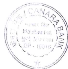
Authorised Officer CANARA BANK